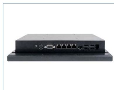
Rich I/O ports to meet wide application demands