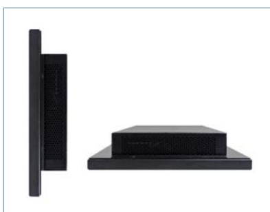
Compact and ultra slim design