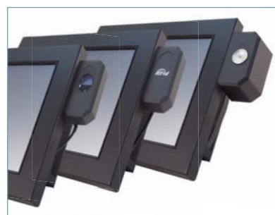
Finger Print, RFID, iButton